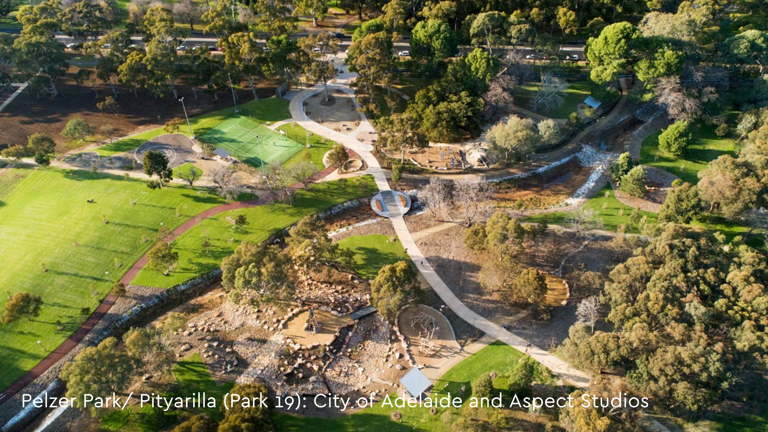
Pelzer Park/ Pityarilla (Park 19): City of Adelaide and Aspect Studios