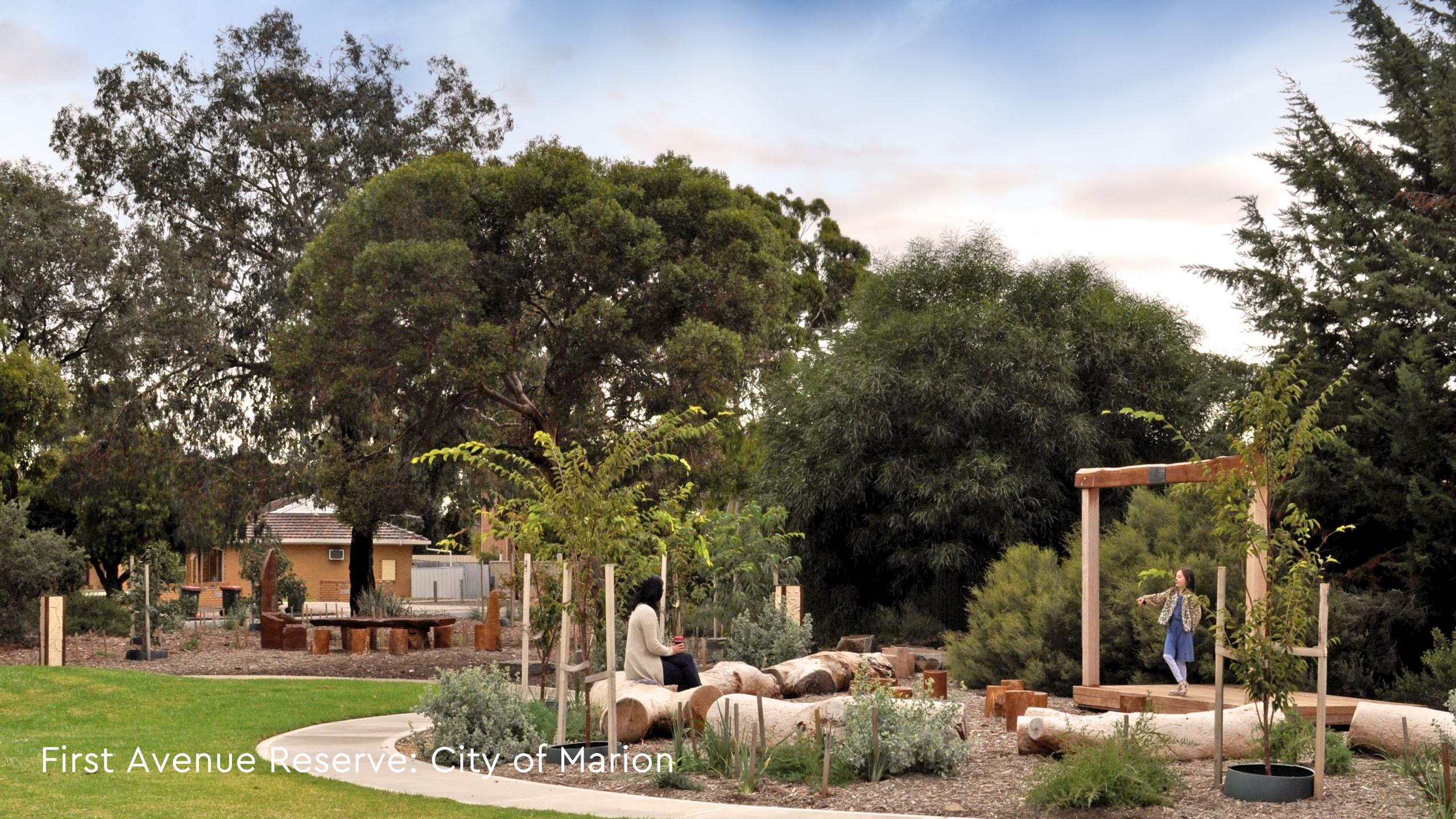
First Avenue Reserve: City of Marion