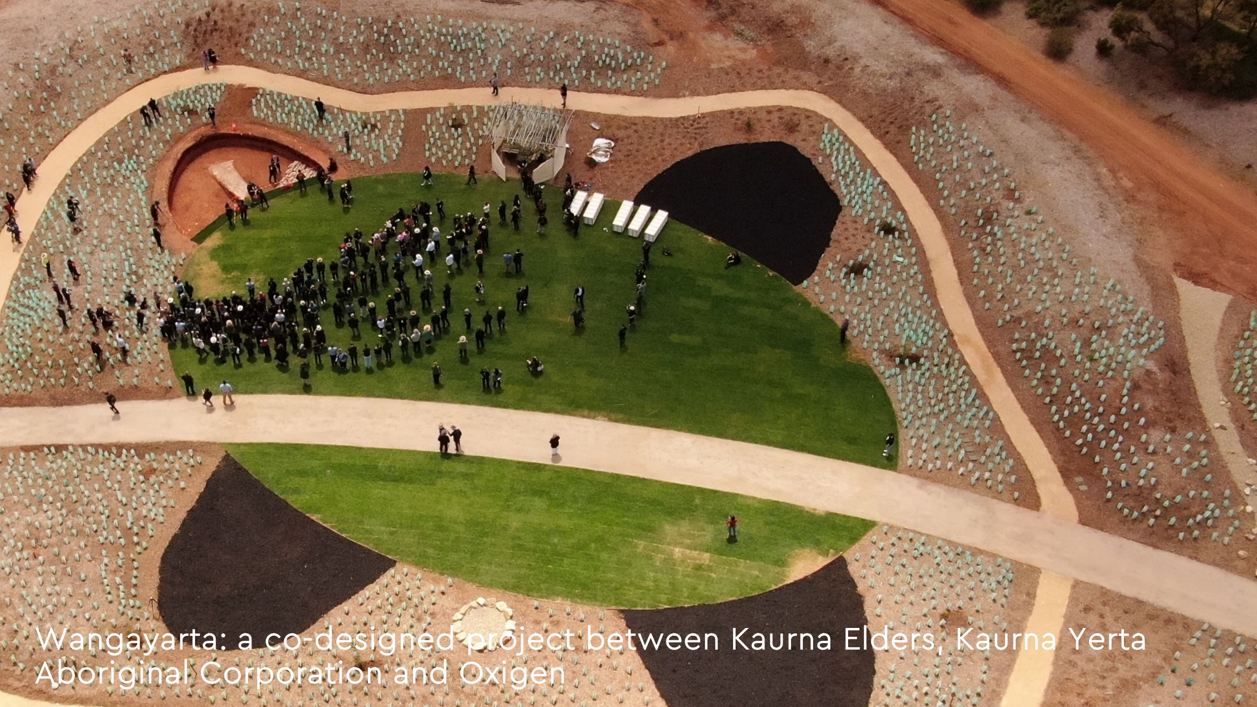
Wangayarta: a co-designed project between Kurna Elders, Kurna Yerta Aboriginal Corporation and Oxigen