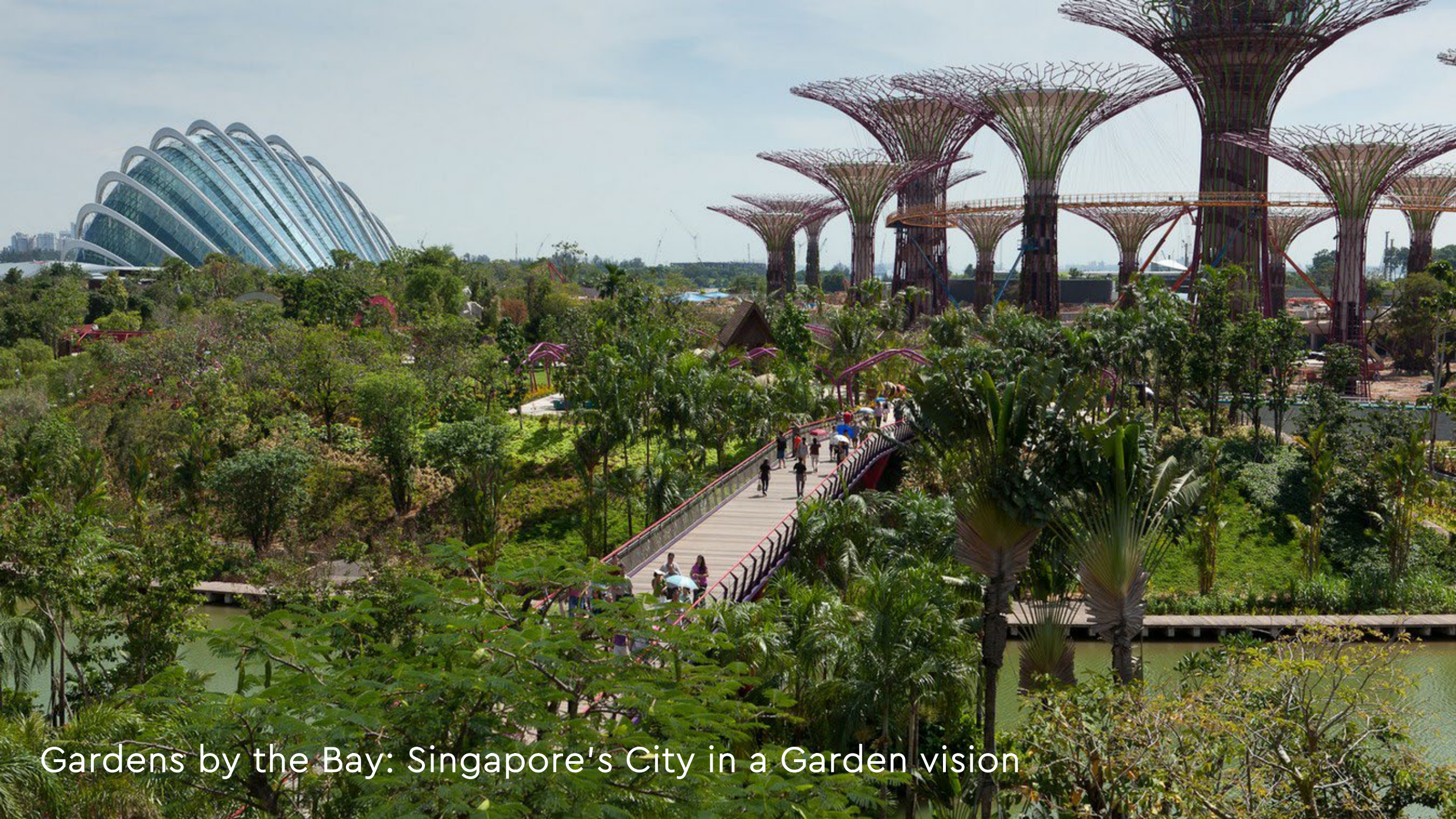
Gardens by the Bay: Singapore's City in a Garden vision