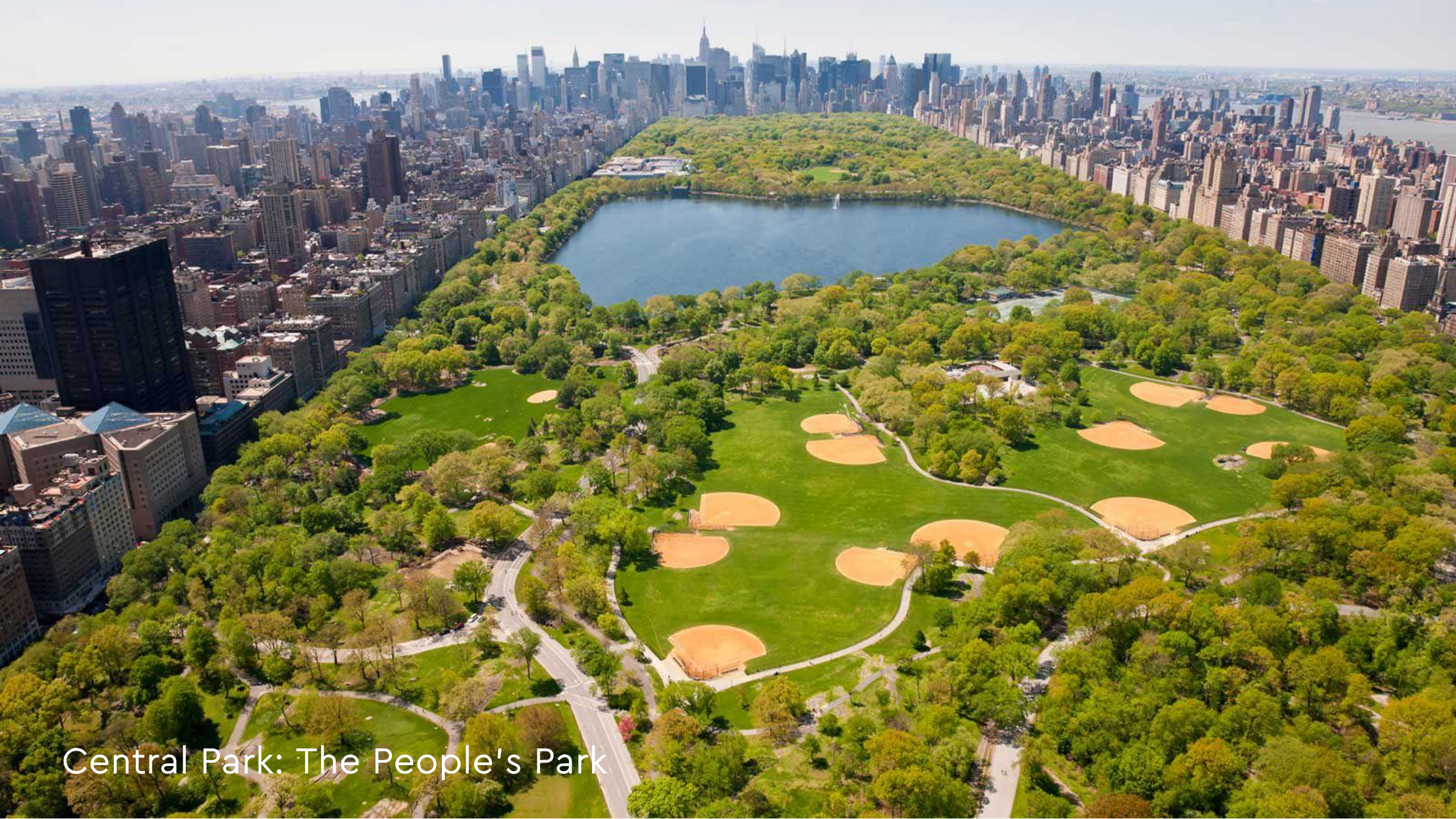
Central Park: The People's Park