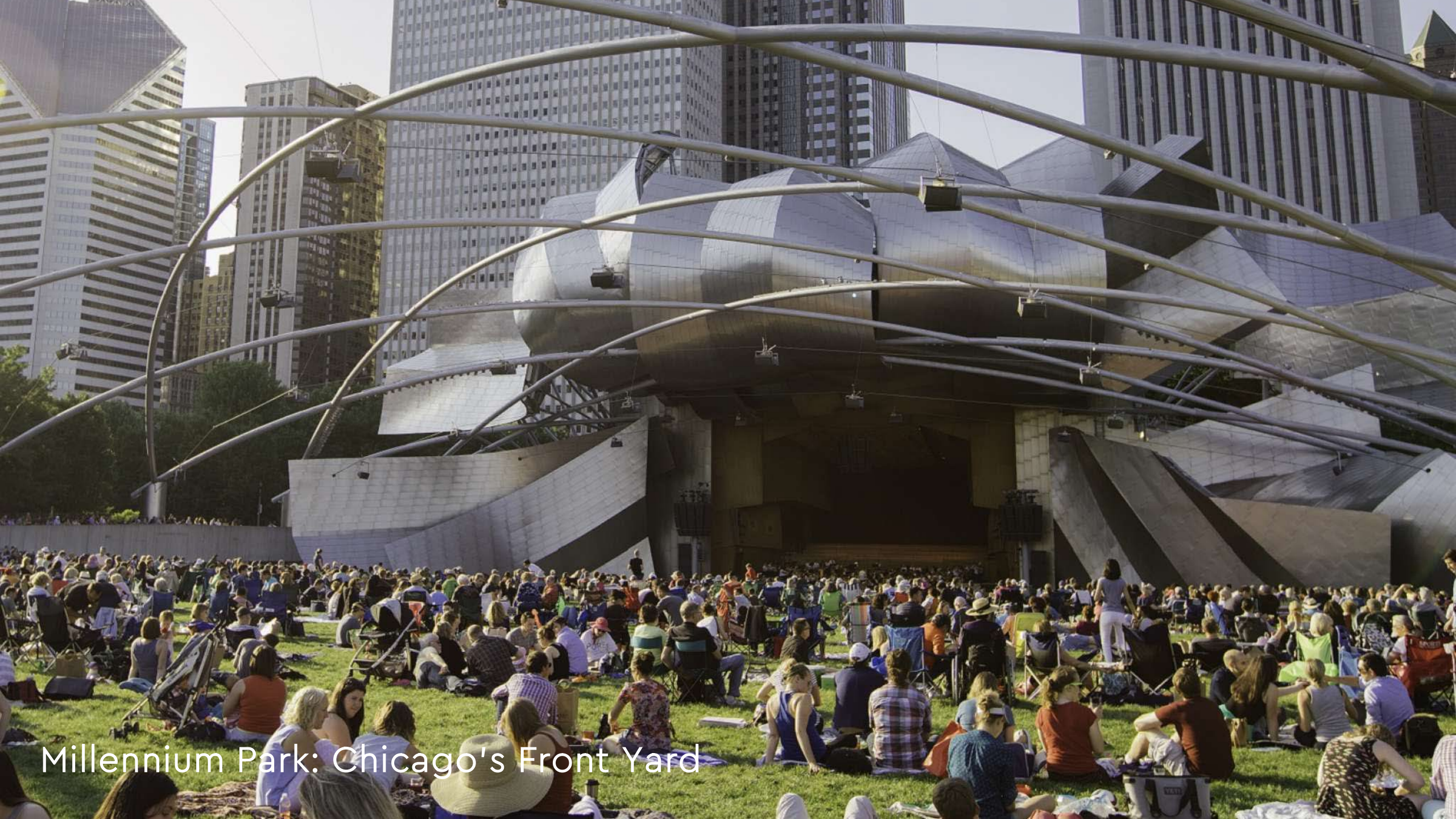
Millennium Park: Chicago's Front Yard